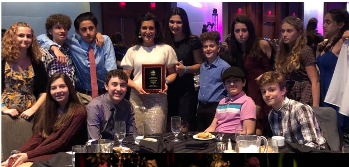
Phoenix Award for Best Costume