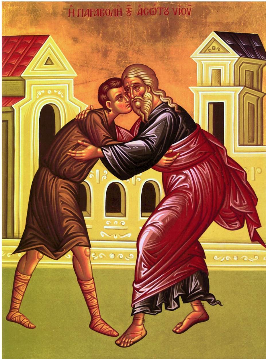
The Return of the Prodigal Son