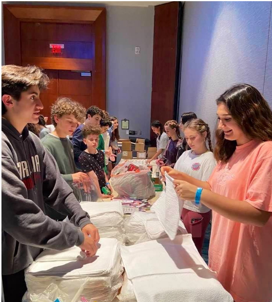
Dancers putting together kits for social services project.