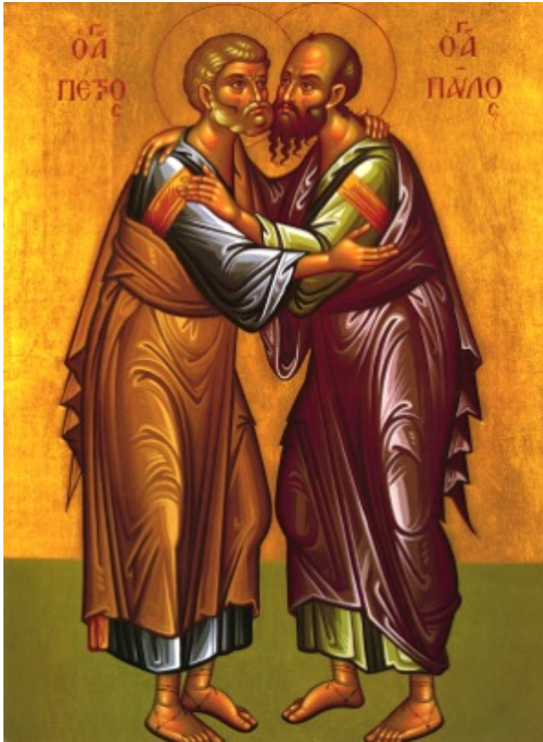
Sts. Peter and Paul - June 29