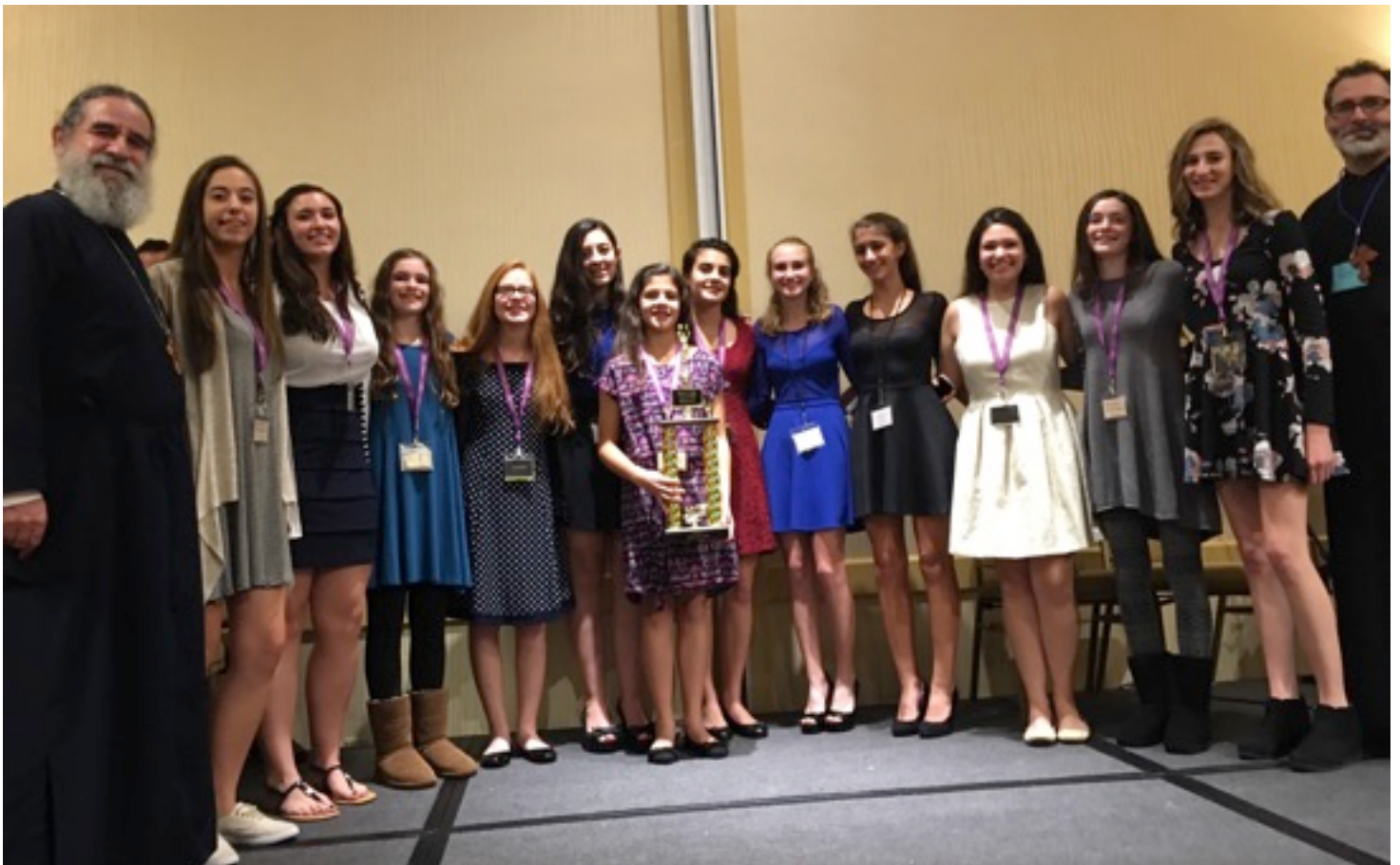
Posing with the Trophy - 3rd place in girls basketball