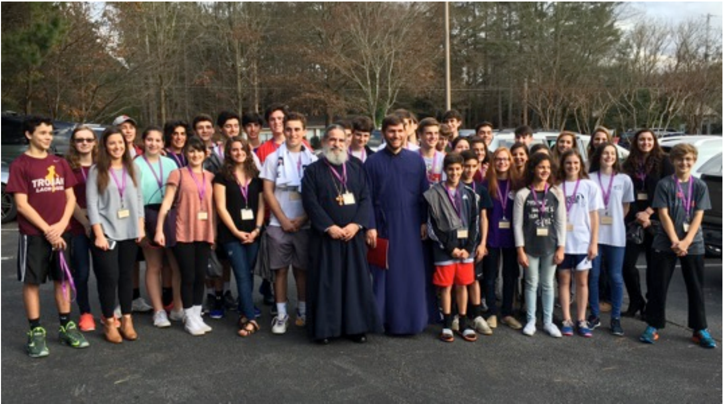
Ready for the trip downtown for the Winter Youth Rally