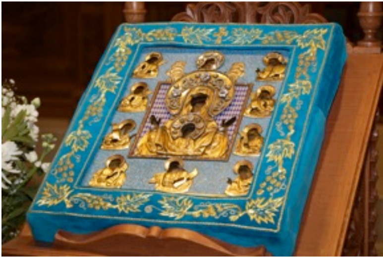
The Icon of Kursk Root is now in the blue Case for protection

We always wonder how and when God is present in our lives! We know that He was present in the events of the Old Testament from the miracles and powerful things He did for the Hebrew people. We know that He was present in the person of Jesus from the miracles He did, from His life, death and resurrection. We know that He was also present with the Apostles. But how is He present in our times, is the question. Can we know that He is present today for us?