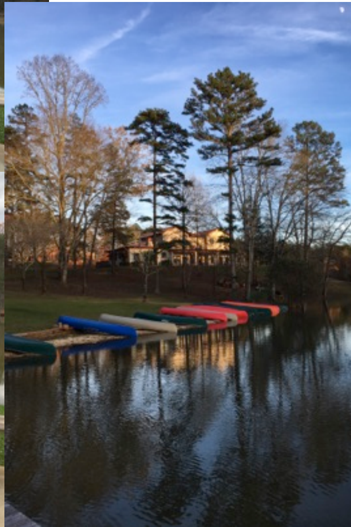
The beautiful Diakonia Retreat Center- view from the lake.